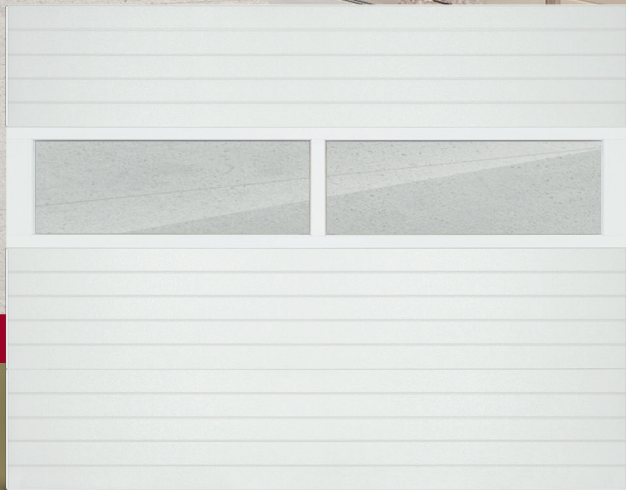
9' x 7' 3285 white with optional white aluminum full-view window section